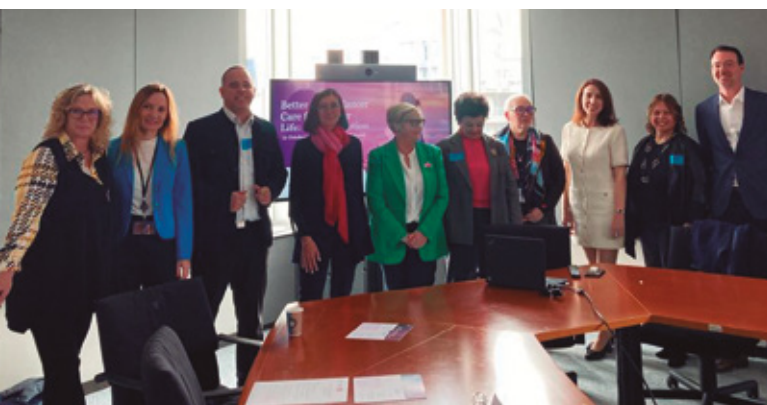
At the October TBCT event at the European Parliament